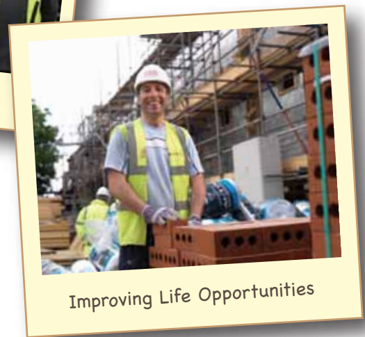
Improving Life Opportunities