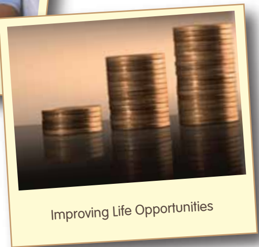
Improving Life Opportunities